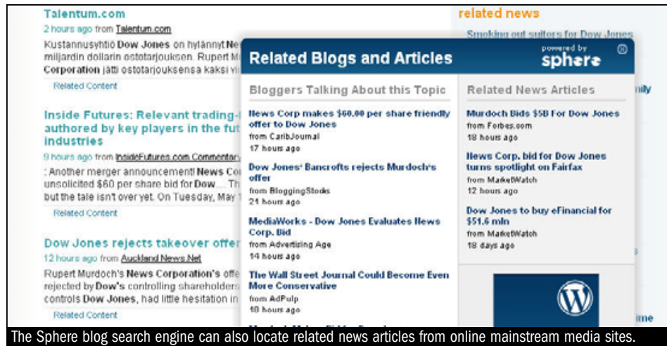
The Sphere blog search engine can also locate related news articles from online mainstream media sites.

Sphere is one of the newer blog search engines, having launched in May 2006, and it searches both feeds and actual posts (see Figure 2). Sphere is unusual in that its goal is to surface all varieties of "conversational media." It does this by surfacing links and related stories between blogs and those published in online mainstream media